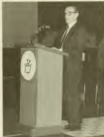
President Kaplan addressed the new students.

Freshmen and transfer students living on campus moved into the residence halls on Sunday, Sept. 4, and returning resident students moved in Sept. 6. Evening classes began Sept. 7 and day classes Sept. 8. Graduate and southeastern Connecticut courses began on Sept. 12. ■